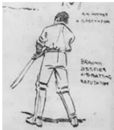
Braund justifies his batting reputation

Len featured prominently in the 4 th test, where he (65 runs) and Jackson (128 runs) scored 193 runs out of an England total of 262. The Daily Graphic had a full-page report of the match (which Australia won by three runs!), including a set of caricatures of some of the stars of the match: 27