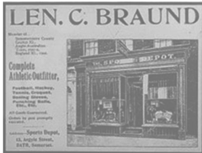
Len's Sports Depot shop at 13 Argyle Street in Bath